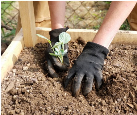
ReImagine Food Systems Backyard Garden Program

On May 28th, TCWAC hosted its first-ever fundraiser, Get Down for Gardens , a virtual concert featuring local folk bands. Through generous contributions from community members and businesses, TCWAC is able to fund the ReImagine Food Systems gardening program for 2021. In June, we planted summer crops at the 7 participating households, all abundant with spring harvest. We also hosted a sensory hike with Boyce Park Nature Center to learn about edible and medicinal plants in the watershed communities. Learn more about upcoming events and sign up at reimaginetcwac.org/events .